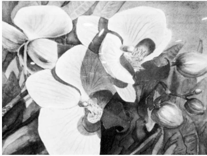
JOAN COOK, Orchids II , Watercolor