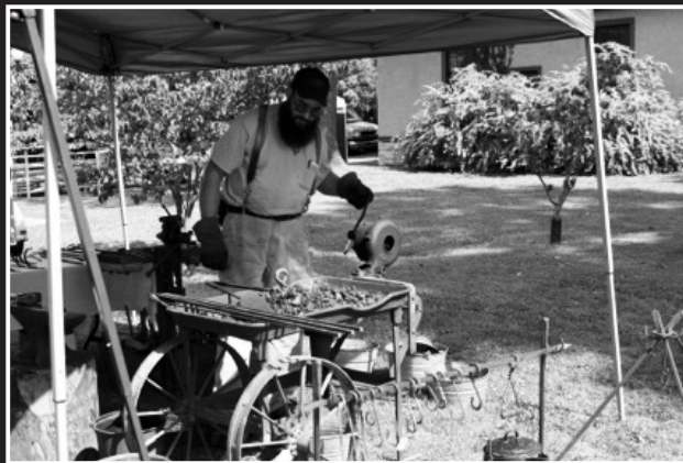
Guests will enjoy the opportunity to spend an early autumn afternoon wandering over the spacious grounds while journeying back into time.

Children and adults who are children at heart are invited to participate in a variety of old-fashioned children's games including cup-and-ball, nine-pins, crafts and other games.